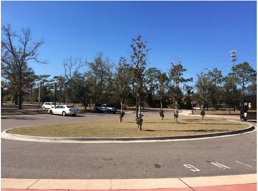
Parking Lot Site at entrance to Legends Community Center