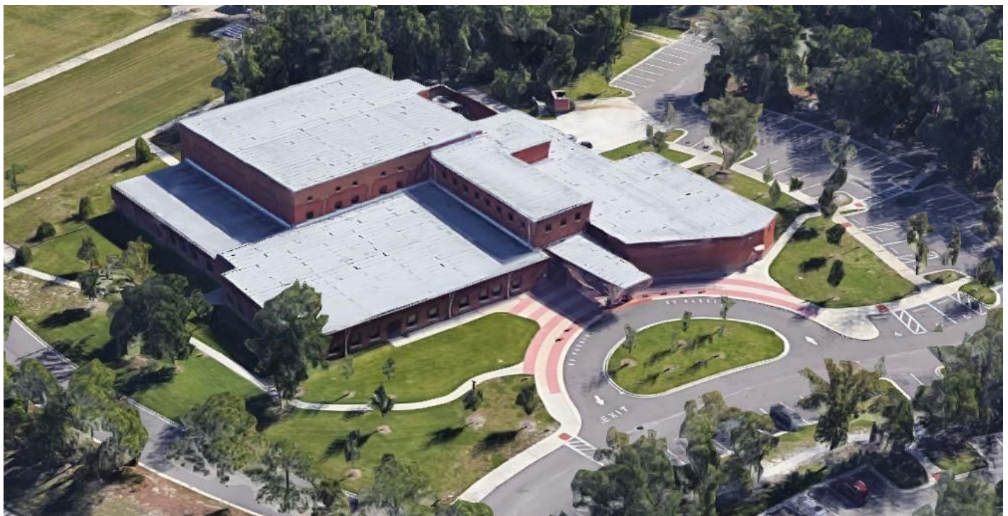
View of Legends Community Center, 5130 Soutel Drive, Jacksonville, FL 32208 showing parking lot island