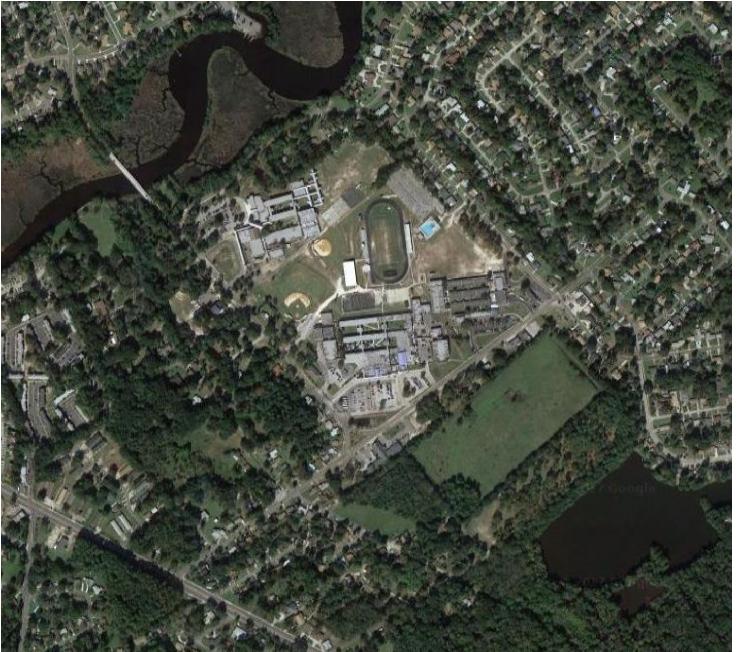
Overview of Winton Drive Traffic Triangle site, with view of Ribault High School campus