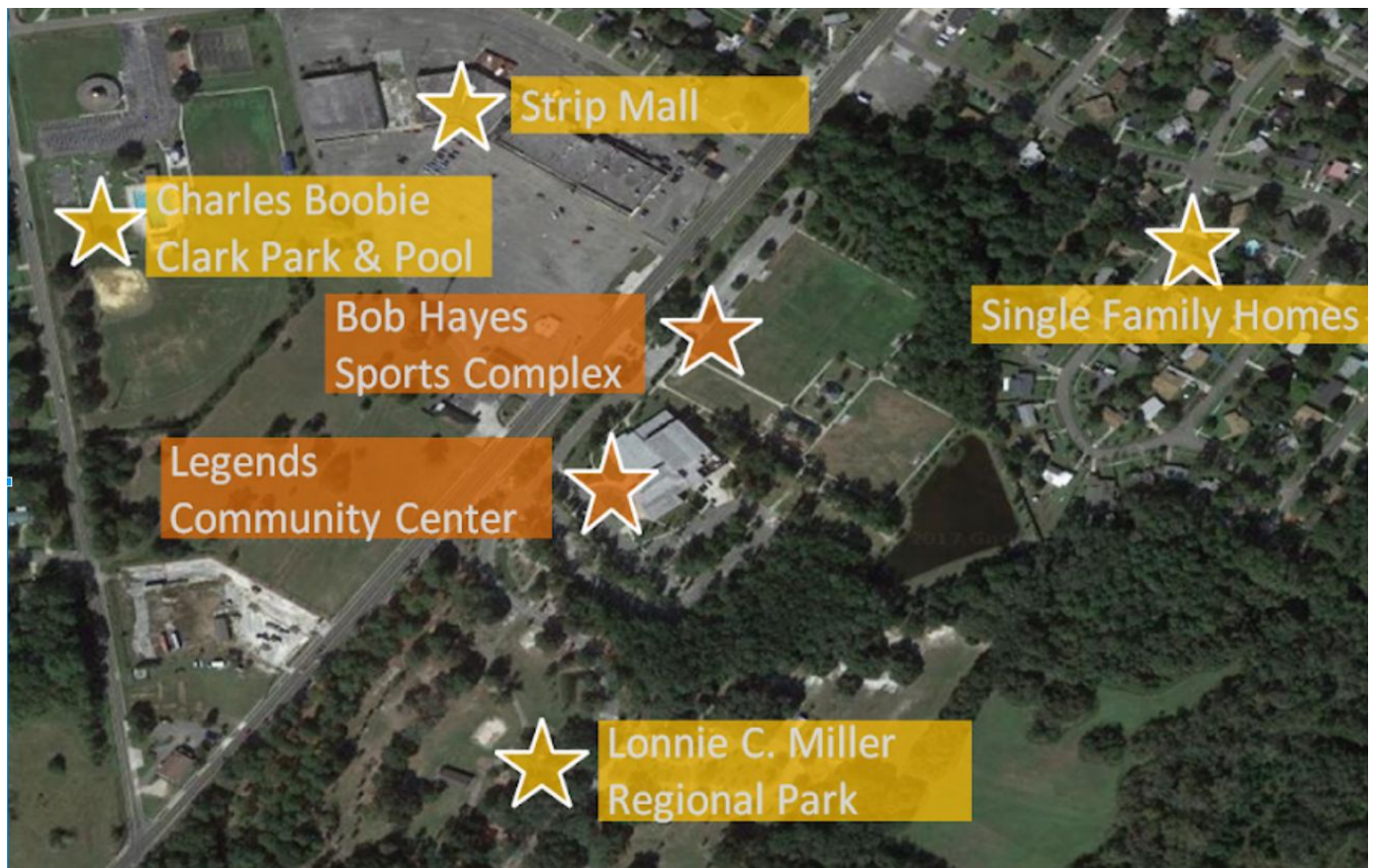
Overview of Legends Community Center Site at 5130 Soutel Drive, Jacksonville, FL 32208