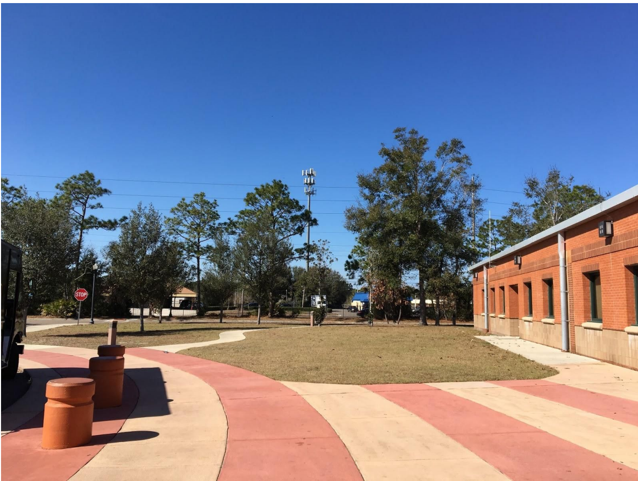
Front of Legends Community Center