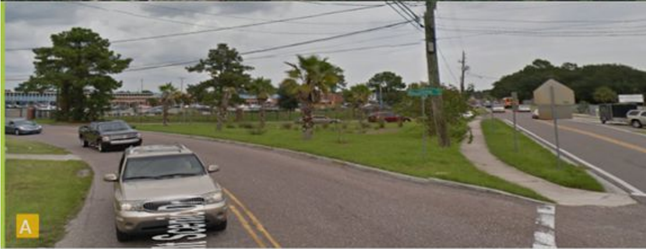
Traffic Triangle site at 3701 Winton Drive, Jacksonville, FL 32208